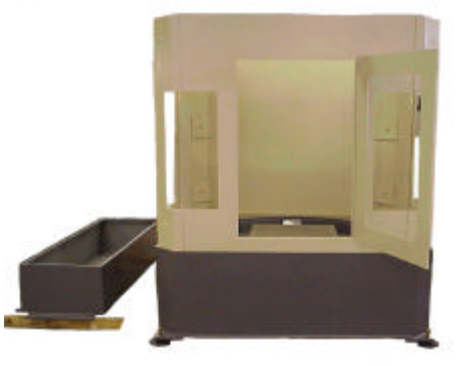
Special Base & Shields