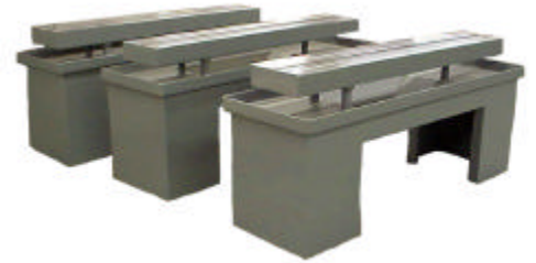
13" X 72" Standard Base (3 Bases)