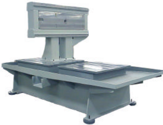
Special Base W/Gantry

Hause machine bases simplify machine development and design, reduce machine assembly time and provide the high degree of rigidity necessary for better accuracy and lower overall building costs.